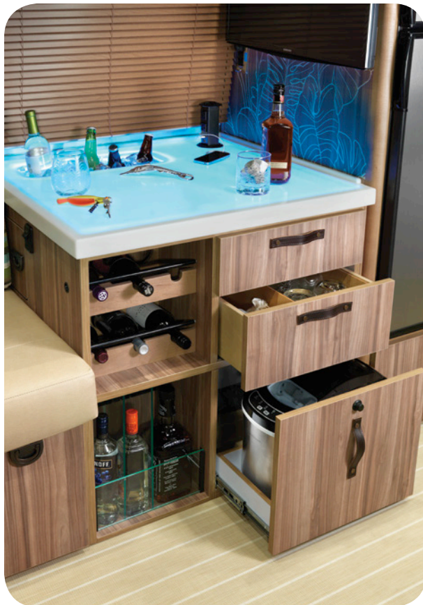
Built-in wine bar offers the ultimate in refined relaxation.

Each trailer comes with a Tommy Bahama® accessory kit, including practical, yet beautifully-designed details for kitchen, bath and bedroom space. All created to make your relaxing getaway even more sublime!